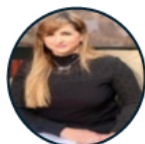
Lobna Abd-Alaziz TV presenter